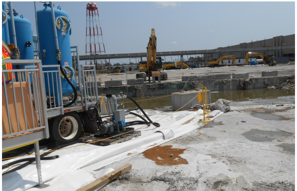
C-410 basement storm water and treatment system