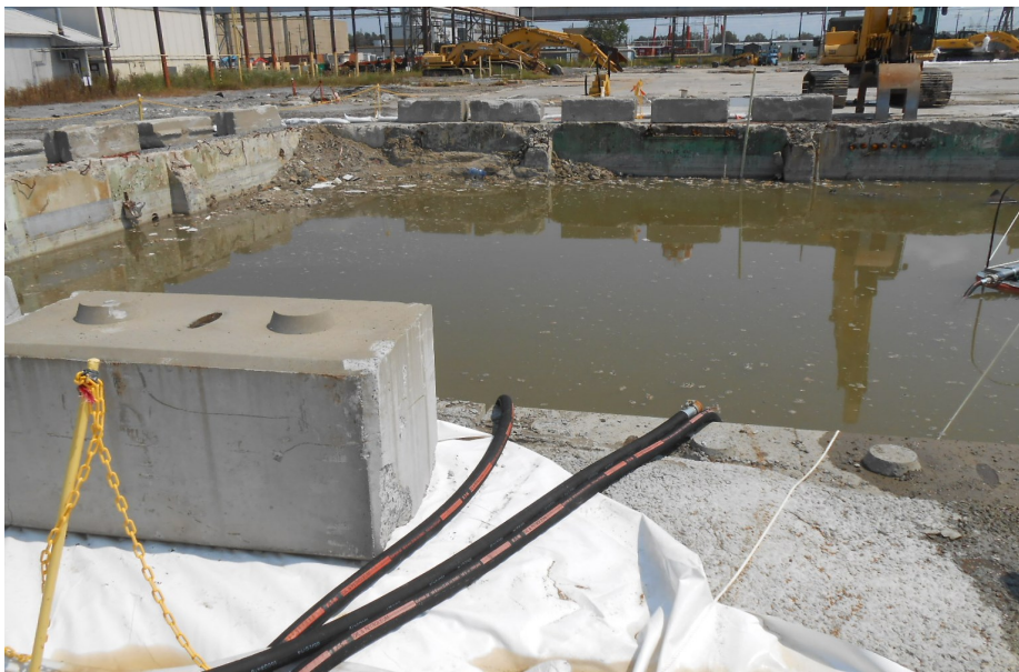
C-410 basement storm water

Treatment of radioactively contaminated storm water retained in the C-410 Section 26 basement commenced the week of Aug. 31 and was completed the week of Oct. 5. Approximately 75,000 to 80,000 gallons of water was treated on-site through a package treatment system. The treated water met a 98 percent reduction in contaminant load for Uranium and a 95 percent reduction in Technetium-99. The water was discharged through internal plant ditches and piping, ultimately discharging at outfall 001. Kentucky and the Department of Energy (DOE) collected confirmatory samples before and after each batch of water was treated. Kentucky independently verified DOE's analytical results. Both Kentucky and EPA approved each discharge event.